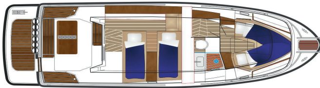
Front and center cabin

Skovshoved Havn 18 DK-2920 Charlottenlund